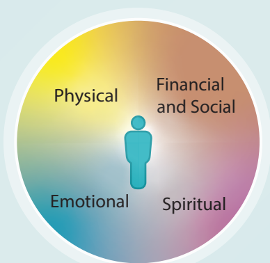
Whole-person health (page 2)